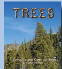
TREES: A COMPARE AND CONTRAST BOOK

Beginning with the roots, this cumulative verse story climbs the tree to a surprise ending. A creative twist to The House that Jack Built .