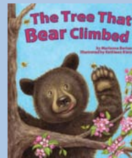
THE TREE THAT BEAR CLIMBED

Daisylocks needs the right habitat to grow. The beach is too soft, the rainforest too wet, and the desert too dry. Will she find the place that is just right ?