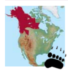
Grizzly bear Ursus arctos

Front print: 5-7 inches long, 4-6 inches wide Back print: 9-12 inches long, 5-7 inches wide