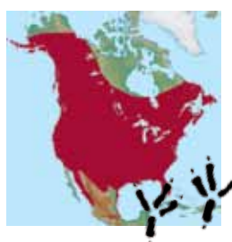
Bald Eagle Haliaeetus leucocephalus