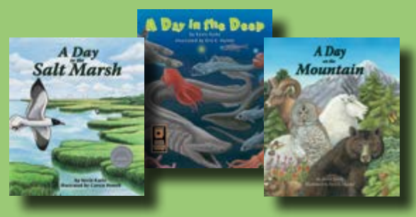
PRAISE FOR THE SERIES

"The format, with rhyming verses, makes the book interesting and fun to read." -The American Biology Teacher