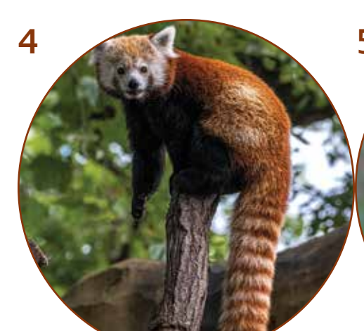
I use my long tail to help me balance.