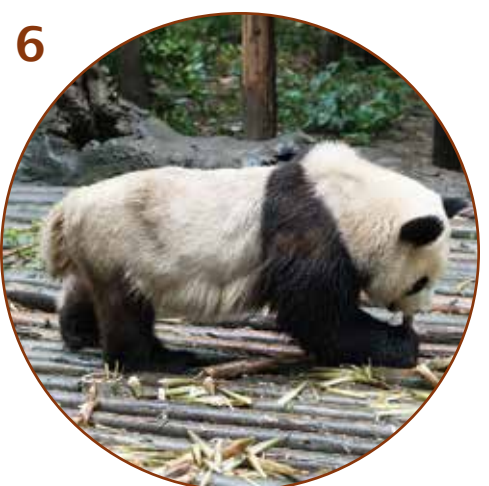
Like other bears, I have a small tail.