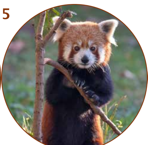
I can stand on my two hind feet. If needed, I can use my front paws to protect myself.