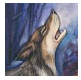
Wolves Web Mammals Meat eaters Wolves hunt as a group but will only kill animals that they will eat.

Urials Mammals Plant eaters Urials are a type of wild sheep that live high in the mountains.