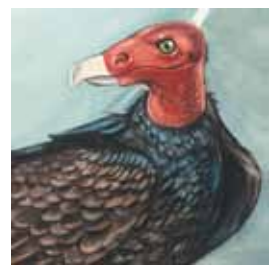
Vultures Birds Meat eaters Vultures' heads don't have many feathers so they won't get all dirty when they eat.