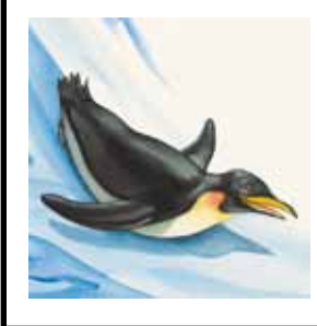
p Penguins Birds Meat eaters These birds do not fly, but they swim and can see underwater.

Newts Amphibians Meat eaters Newts have four "toes" on their front feet and five "toes" on their back feet.