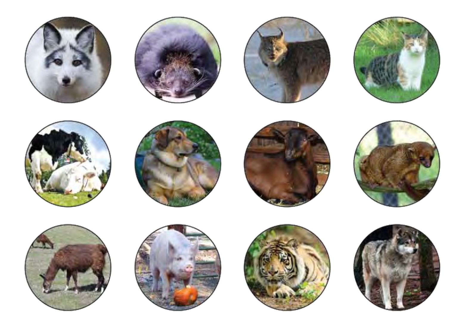
Farm: cow, goat, llama, pig. Answers: Domestic Pets: cat, dog. Exotic: arctic tox, binturong, Canadian Iynx, kinkajou, tiger, wolt.

Farm animals are raised to produce food (milk, eggs, or meat) or fiber (wool) for humans. Which animals are pets, exotic animals, or farm animals (livestock)?